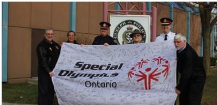
Flag Raising in Guelph